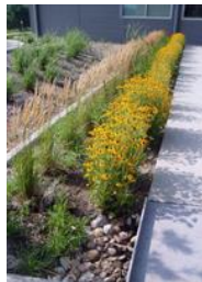
Reducing Impervious Areas