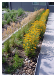
Reducing Impervious Areas