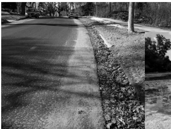
Gately Terrace leaves during spring thaw