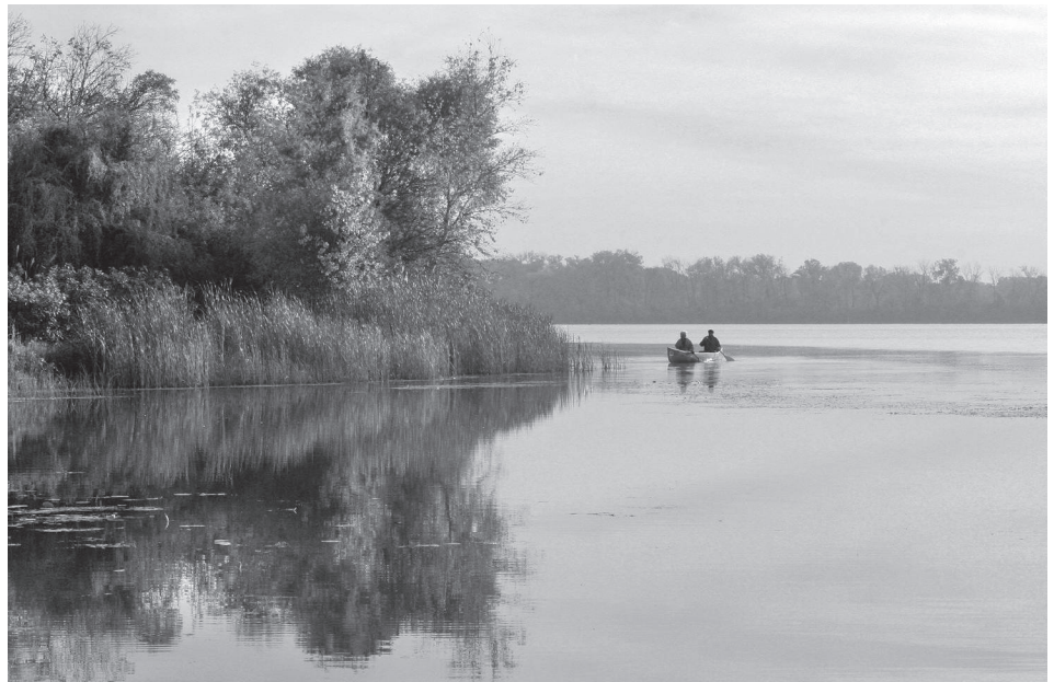
Lake Wingra in fall

Much like Aldo Leopold’s land ethic expands the boundaries of a community, watersheds may be seen as unique communities. Residents within the watershed are bound together by physical and hydraulic conditions, but we are also members of a community. Each household within a watershed can have a direct effect on the quality and quantity of surface water running off a property. Our actions can help or harm the health of the lake, and have consequences for the watersheds downstream.