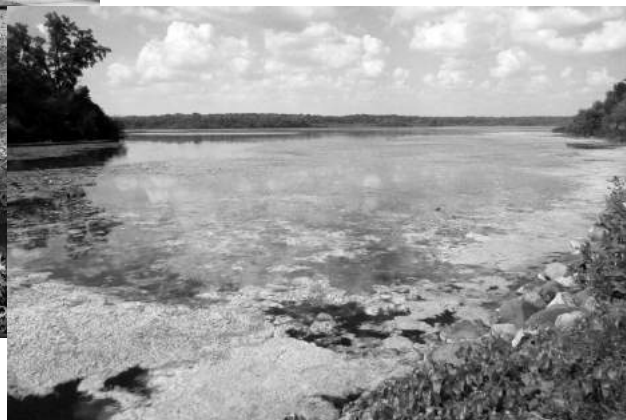
Lake Wingra weeds