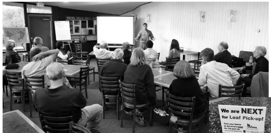
Midvale Heights neighbors learn about the leaf pilot project.

Friends of Lake Wingra installed the first signs on October 16. The day before the city picked up the leaves, a total of 35 homes had neat piles of leaves on the terrace and most had a minimal amount of leaves in the gutter. A successful pilot program will likely lead to expansion to other parts of the watershed or other city streets.