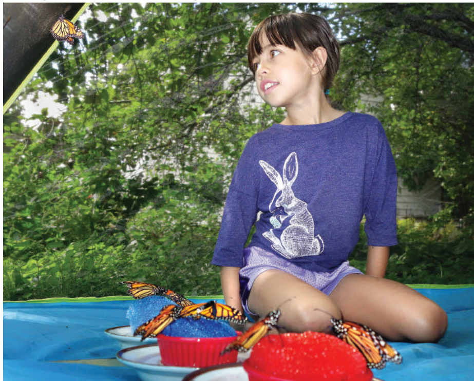
Feeding monarchs in the breeding tent

schools. Working with bilingual schools here in Madison—Midvale and Lincoln—eliminates the language barrier and provides an opportunity for children in both countries to understand common interests and connections. Saving monarchs (continued on page 2)