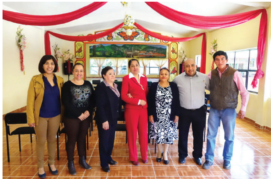
Teachers at the elementary school in Anganguero, Mexico.

(continued from page 1) requires action in both countries.