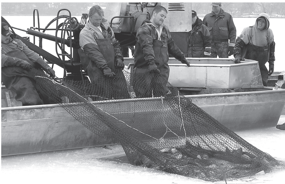
Brimming with carp, the net is hauled up through the ice.